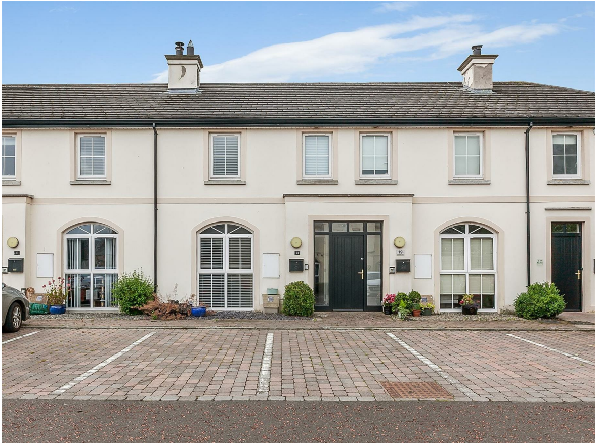
21 Gullivers Lane, Ballynure, BT39 9YQ